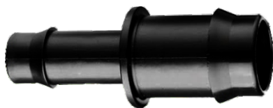
Barbed Reducer Nipple