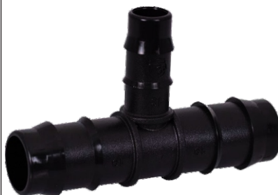
Barbed Tee Reducer