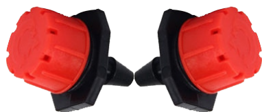
Emitter – Dripper