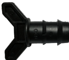
Barbed End Cap