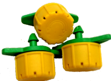
Emitter – Dripper